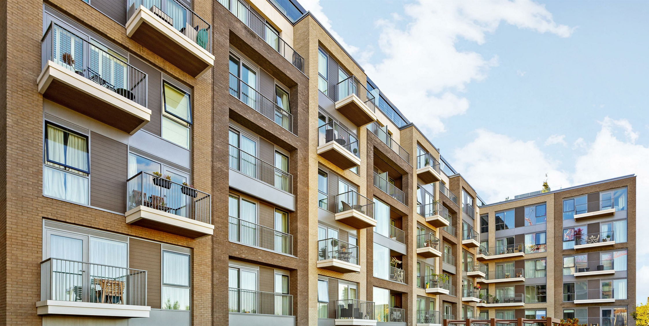
Lockside House, Chelsea Creek Fulham SW6